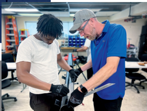
Senator Street continues to secure funding for technical career schools like North Philadelphia's PTTI Institute.