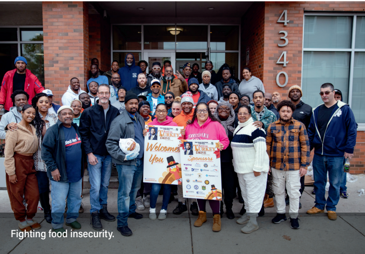
Fighting food insecurity.

With the passage of the Urban Agriculture Infrastructure Grant Program, which I authored in 2019, we've been able to provide state support to 113 programs! The program is helping urban community gardens close the gap on food scarcity with collaborative grants up to $50,000, and micro grants up to $2,500.