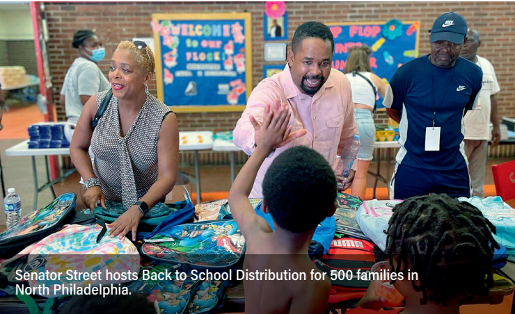
Senator Street hosts Back to School Distribution for 500 families in North Philadelphia.

Food scarcity is something that too many in our community continue to struggle with.