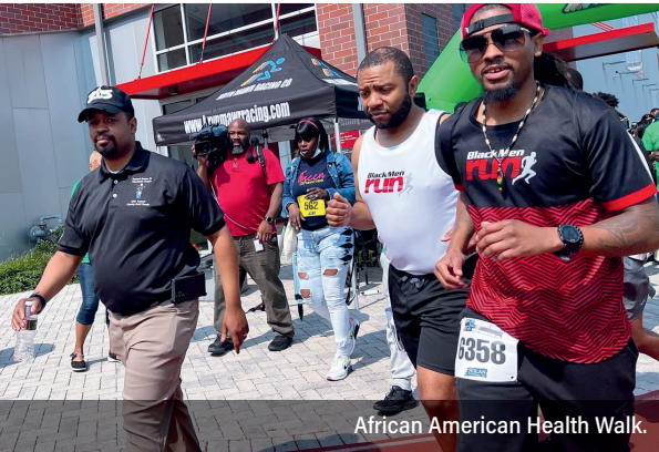
African American Health Walk.

In my role as your state senator, I continue to use every resource available to positively impact your health. Our communities have long struggled with equal access to healthcare and things that positively impact our health. Health is holistic, and in a world of COVID it is critical that we address your health in a comprehensive way.