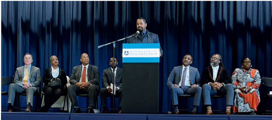
Senator Street welcome remarks during the ribbon cutting of the new T. M. Peirce School.